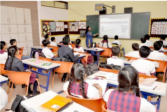
Basic Amenities Convergence