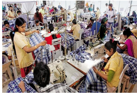
Industries and Livelihood